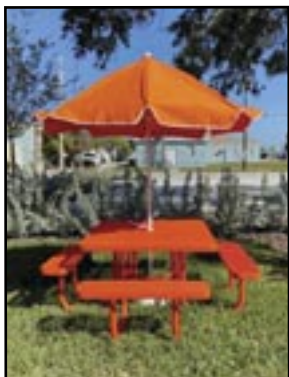
Nice umbrella picnic table given to staff by Friends Board and set up in nice grassy area.