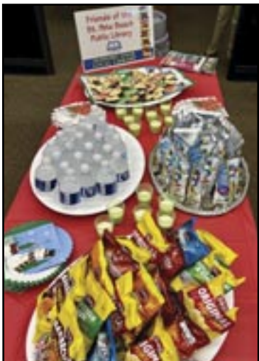
FOL providing treats at library events.